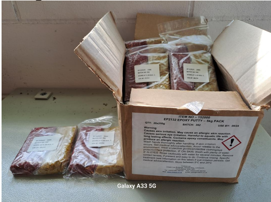
Galaxy A33 5G

5 kg box containing 20 packets of 250g epoxy putty and hardener