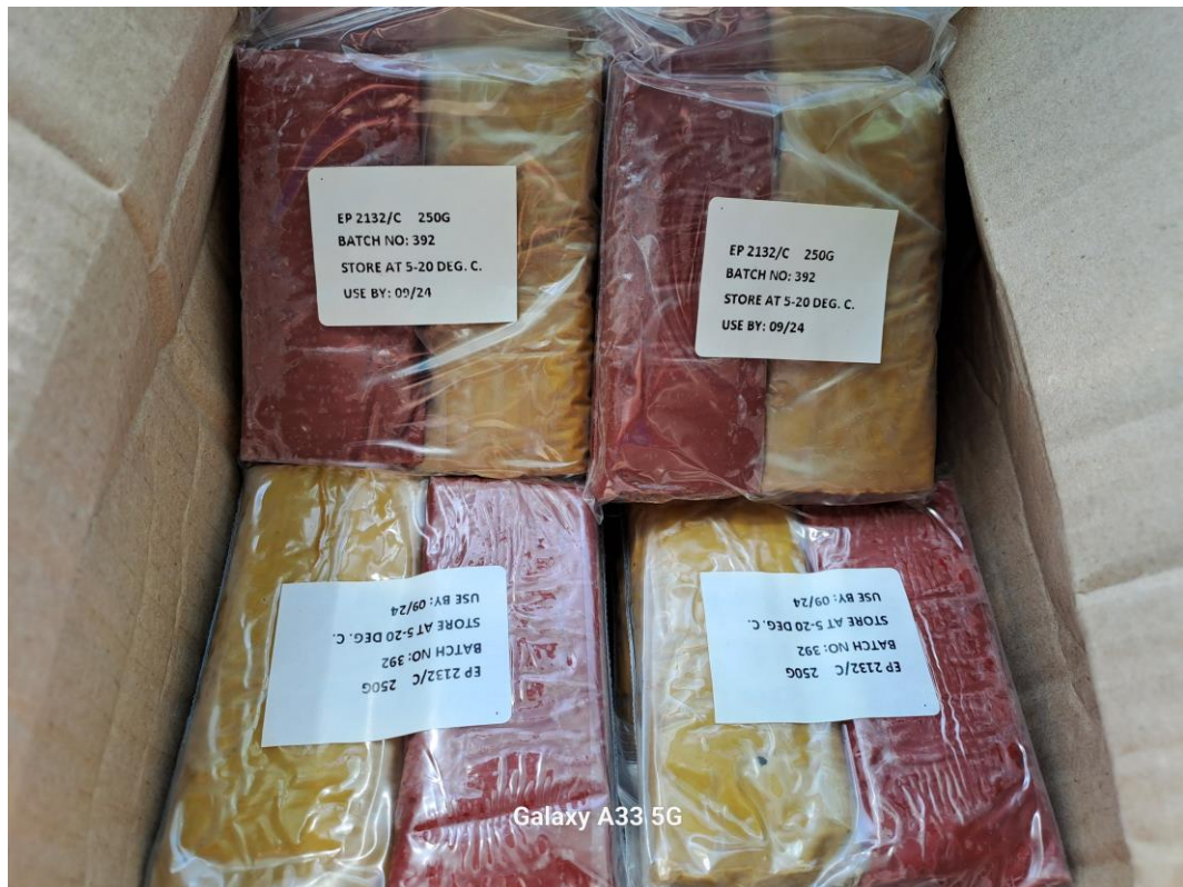
Galaxy A33 5G

5 kg box containing 20 packets of 250g epoxy putty and hardener